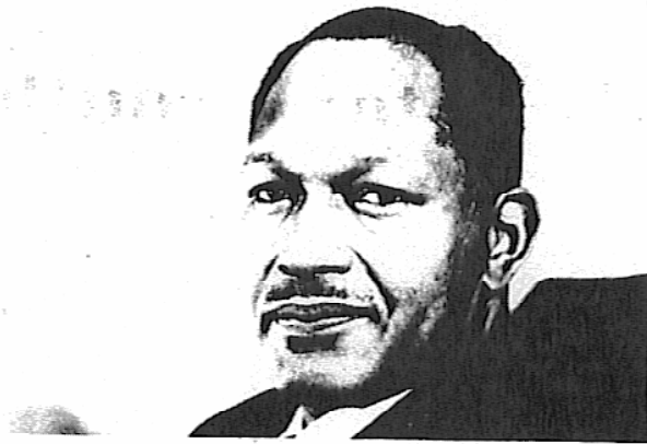
Los Angeles Mayor Thomas Bradley

Bradley would return to Los Angeles and meet with city council members for action on