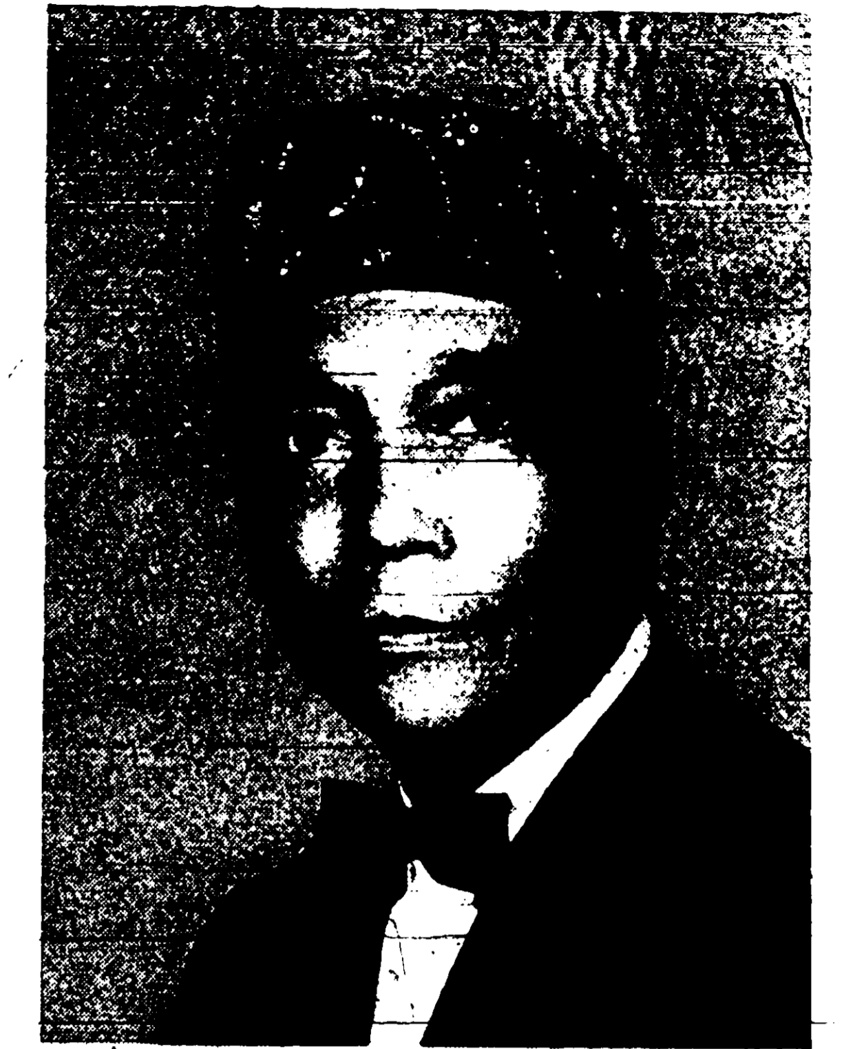
The Honorable Elijah Muhammad Messenger of Allah

I SAY, Brother and Sister, in Black America, Rejoice and be exceedingly glad for you once had — and