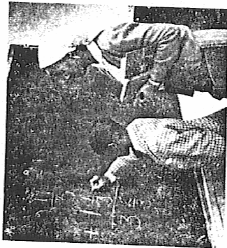
AT BLACKBOARD, a student gets lesson in arithmetic from instructor.